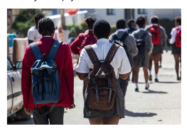
Matric results are being released on 14 January.

13 January 2025 | By Kirav Doolabh and Veer Gosai